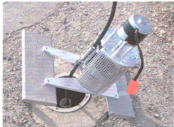
Pump rotated down onto well for pumping.

For efficient operation of the pump, there must be sufficient resistance to the force applied to the pumping tube on its downstroke. At low motor speeds and flow rates the weight of the pump and drill and/or motor may provide enough weight resistance to the force of the downstroke. At moderate speeds and flow rates the more weight resistance to the downstroke force is needed. The operator can simply stand on the pontoons to provide additional resistance weight, or if a car battery is used for power, the battery can be placed on the front pontoon for additional weight.