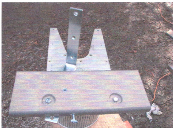
Rear pontoon and brace attached for above-grade mounting. Note storage location of set screw.

The pump can be mounted on circular wells surrounds 4 to 12 inches in diameter. For above-grade mounting, the pontoons are attached to the front and back of the baseplate so that the wide portion of each pontoon faces inward. The rear pontoon is attached before the front pontoon to allow the insertion of the metal brace beneath the rear pontoon. A set screw holds the brace fully retracted while the front pontoon is attached. The set screw is retrieved from its storage location on the side of the rear pontoon.