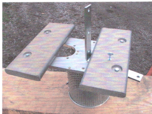
Front pontoon attached for above-grade mounting. Note set screw holding brace fully retracted.

For a level, circular well surround, place one of the supplied 1" thick shims on the well and then place the pump on the well with the vertical brace against the well surround. The shim supports the pump on the top of the well surround. Strap the brace to the well surround with the supplied ratchet/tape set, loosen the brace set screw, slide the pump horizontally to position the follower over the pumping tube, bind the brace with the set screw, and attach the pumping tube to or through the follower. The pump is now mounted for operation.