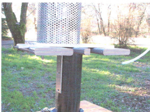
Pump on 4" surround with brace fully retracted and pump supported on 1" shim.

For a level, circular well surround, place one of the supplied 1" thick shims on the well and then place the pump on the well with the vertical brace against the well surround. The shim supports the pump on the top of the well surround. Strap the brace to the well surround with the supplied ratchet/tape set, loosen the brace set screw, slide the pump horizontally to position the follower over the pumping tube, bind the brace with the set screw, and attach the pumping tube to or through the follower. The pump is now mounted for operation.