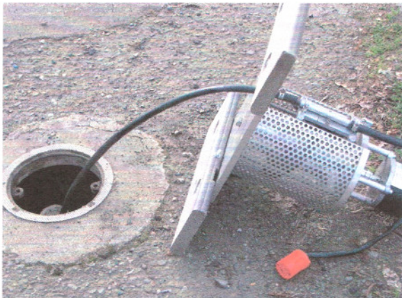
Pump rotated backward to permit easy attachment of pumping tube to follower.

For at grade wellheads, the pontoons should be attached to the front and back of the aluminum baseplate so that the wide portions of the pontoons face outward. The pumping tube is most easily attached to the end of discharge tube by laying the pump on its back with the edge of the rear pontoon and backside of the motor touching the ground, lifting the pumping tube from the well, and pushing the tube onto the pipe nipple and tightening the hose clamp. The pump is rotated upright over the well while feeding the pumping tube into the well.