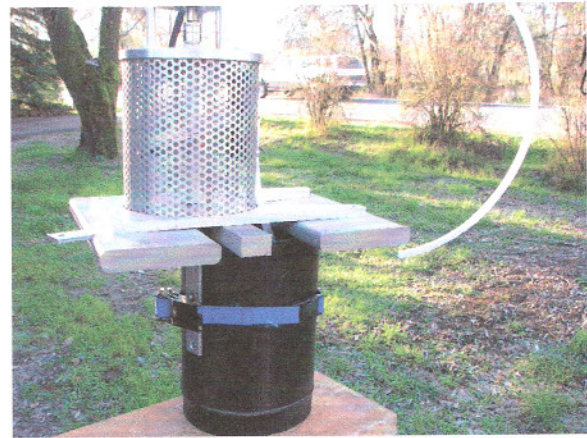
Pump mounted on 8 inch well surround (stove pipe). Pump rests on shim and front pontoon.

For well surrounds up to 12 inches in diameter, the brace slot in the rear pontoon is modified by cutting away 2 inches of the slot so that the brace can be retracted an additional 2 inches. A rear pontoon modified in this way is available upon request. When the pump is mounted on a 12 inch well the pump rests on the front and back pontoons.